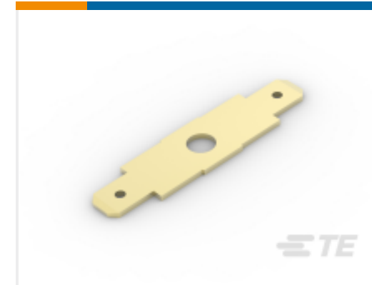
TE Part # 62298-1 187 FASTON TAB BR