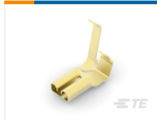
TE Part # 62817-1 187 FASTON FLAG REC 20-16 AWG BR