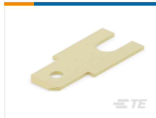
TE Part # 60613-1 205 FASTON TAB BR