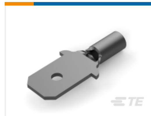
TE Part # 61907-1 187 FASTON TAB TPBR