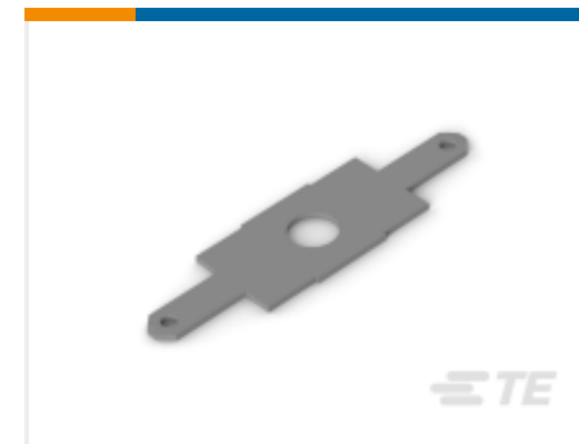
TE Part # 62628-1 100 FASTON TAB TPST