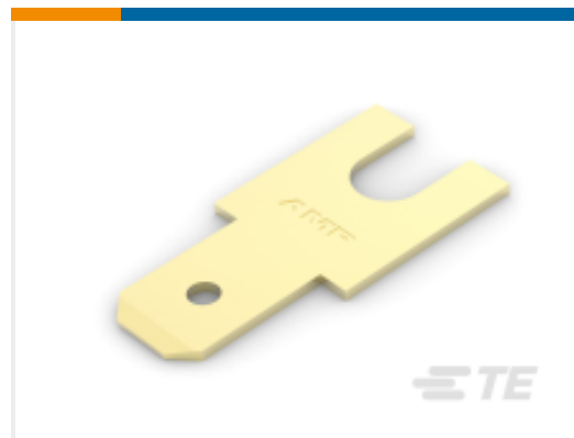
TE Part # 60443-1 187 FASTON TAB BR