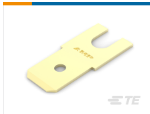
TE Part # 63633-1 250 FASTON TAB BR